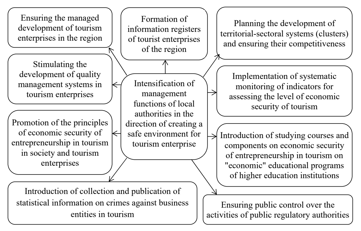
Figure 2. Activation of management functions of local authorities in the direction of creating a safe environment for tourism (structure)

in any area of public regulation of the economy and have an impact on micro-entrepreneurship must be considered and evaluated in terms of their impact on the economic security of the micro-enterprise sector, both during the effects of the COVID-19 pandemic and in the post-coronavirus perspective. The strategic orientation in the management of economic security of the tourist micro-enterprise of the region on longterm and rational sustainable development obliges public administration to make management decisions taking into account not only the set of external and